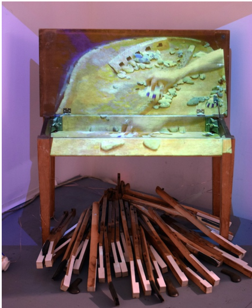
Evelyn Ficarra, Piano Bench Variations , 1078 Gallery, January 2019